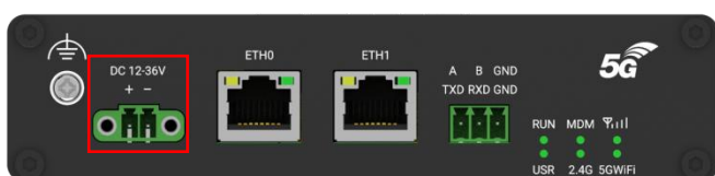
2-pin 3.5 mm Terminal Block with Lock