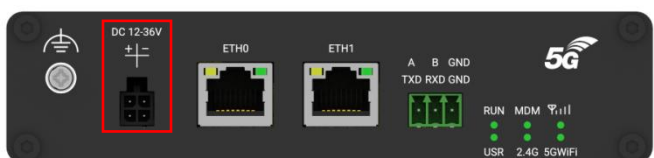
4-pin Micro-Fit Socket